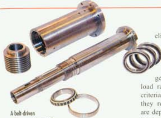
A belt-driven milling machine spindle with hybrid ceramic rear roller bearings and synthetic grease lubrication eases problems caused by belt pull at high speed.

Conventional belt-driven spindles, which use a pair of angular contact bearings at the belt-drive end, may have problems with spindle deflection and premature failures. At high speeds, the belt pull loads the bearings radially and also restricts the axial movement of the bearings to compensate for the